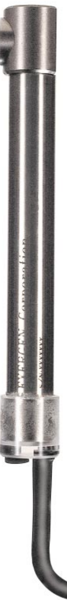
SnakeEye™ Sideview model (actual size)

SnakeEye validates both product and packaging.